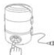
Plug in the power, press the switch for about 15-18 minutes and you are ready to eat

2. Cooking rice: Add about 200ML of water into the body, pour a proper amount of raw rice and water into the inner tank of the lunch box and put them into the body together, then close the cover, turn on the power, press the switch, about 30- Ready to eat in 40 minutes. (As shown below)