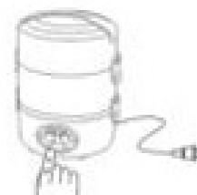
Plug in the power, press the switch for about 30-40 minutes and you can eat