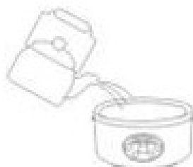
Pour about 200ML of water into the body

2. Cooking rice: Add about 200ML of water into the body, pour a proper amount of raw rice and water into the inner tank of the lunch box and put them into the body together, then close the cover, turn on the power, press the switch, about 30- Ready to eat in 40 minutes. (As shown below)