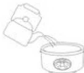
Pour about 200ML of water into the body

1. Heating meals: add 200ml of water into the body, put the rice, vegetables and soup to be heated into the lunch box, vegetable plate and soup bowl in the original packaging, and then put them into the body together, and then cover the shelf and upper cover. , turn on the power, press the switch, about 15-18 minutes to eat. (As shown below)